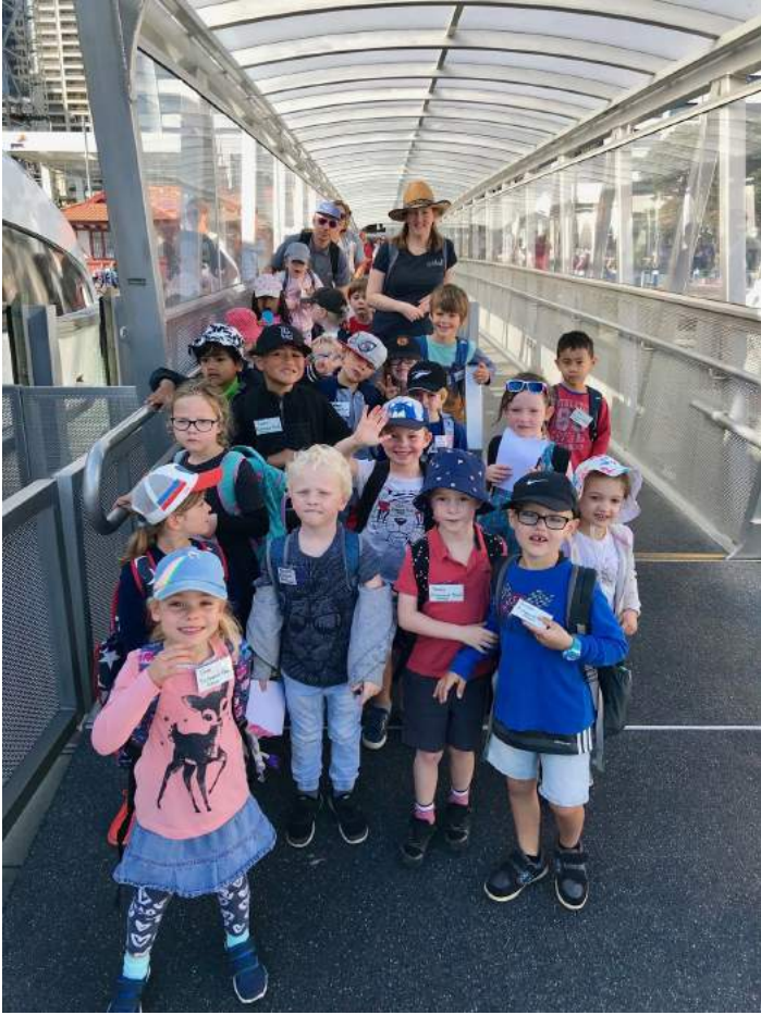
All set to go!