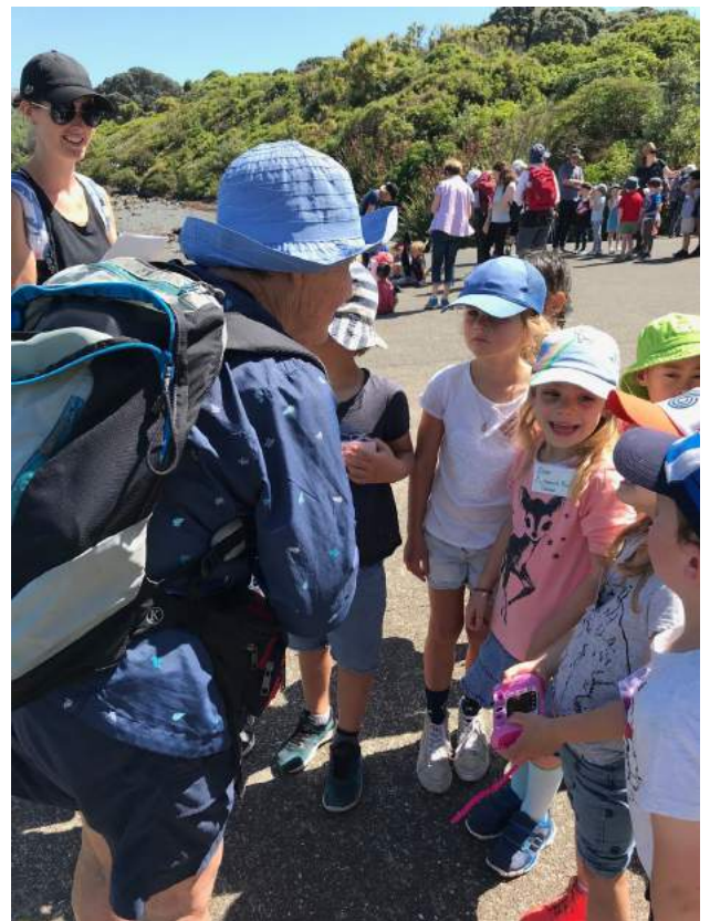
We all made it back safe and sound. The ride home on the ferry was so relaxing. We can't wait to do it again.