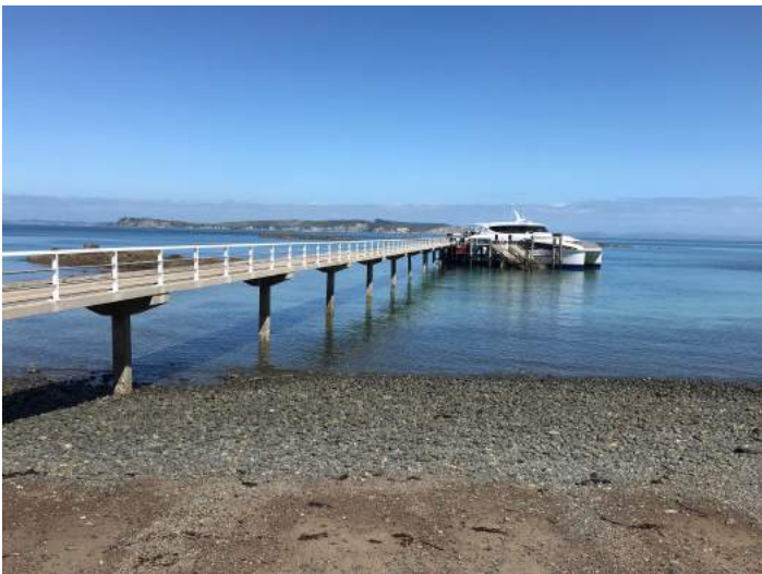
The wharf at Tiritiri Matangi