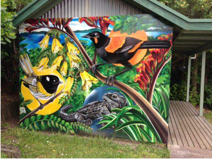
The amazing toilet block mural near the lighthouse.