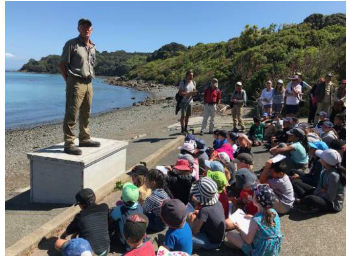
The ranger talking to us before we set off through the bush.