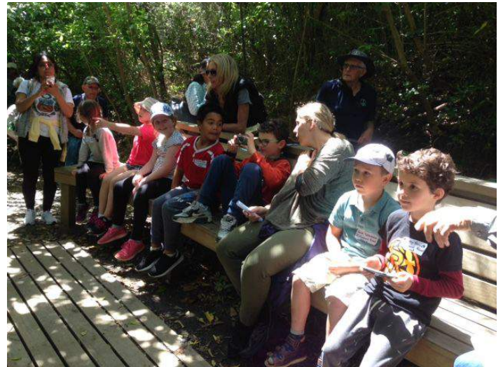
Waiting quietly and patiently for birds to visit the water trough.