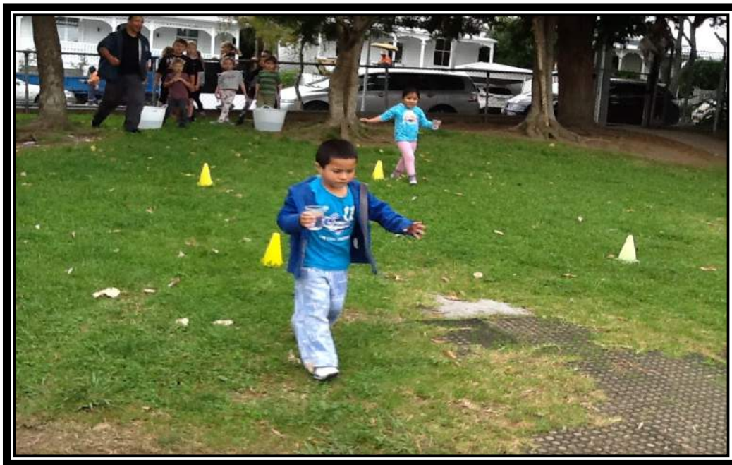
Getting active at Junior Cross Country on Tuesday O nisi nei o ata mai i le Junior Cross Country (16 May 2017)