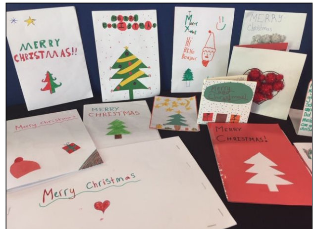
L'Envol senior's cards are ready to go!